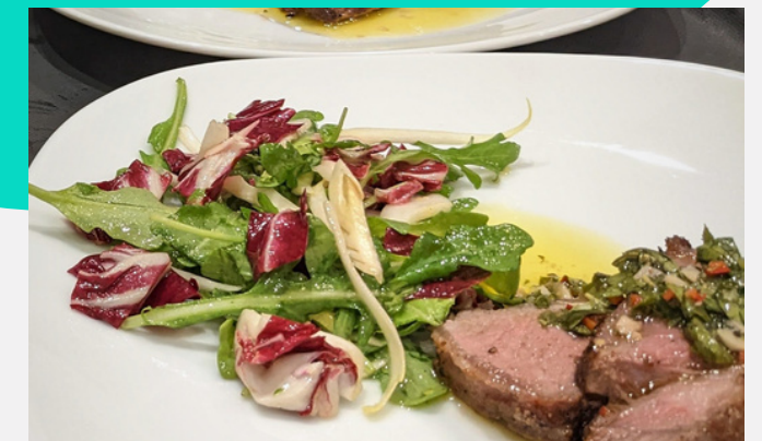
Taste of Sewickley September 10

Thousands of guests joined KidsVoice at Carnegie Science Center for a day of crafts, learning—and giant bubbles! In honor of the event, KidsVoice clients were able to visit the museum for free.