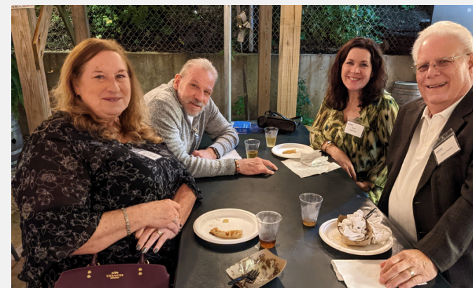
Guardian Recognition October 12

Featuring Spanish cuisine, the all-volunteer Taste of Sewickley, a delectable dinner prepared by local amateur chefs, raised glasses—and funds—in honor of KidsVoice.