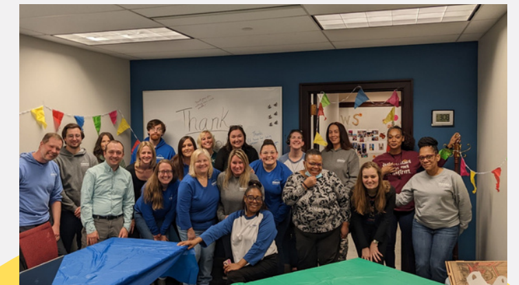
Give Big Pittsburgh November 29

Held this year at Threadbare Cider, this annual event invites KidsVoice's stalwart supporters to socialize and enjoy different venues around the city.