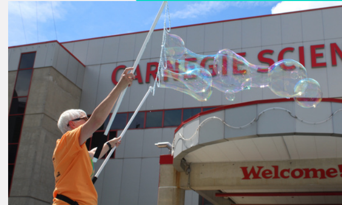
Kites for Kids May 14

Thousands of guests joined KidsVoice at Carnegie Science Center for a day of crafts, learning—and giant bubbles! In honor of the event, KidsVoice clients were able to visit the museum for free.